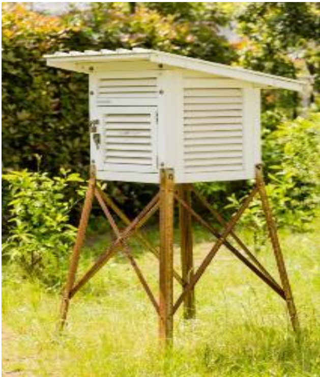
Image of Small Stevenson Screen